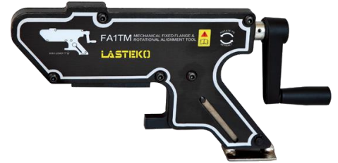
Minimum extension FA1™ in mm (inch)